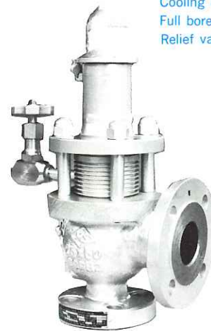
Model SVC-301-T 冷却筒柱全量式安全阀 Cooling pool Full bore Safety Relief valve