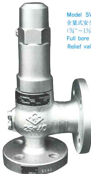
Model SVC-302 全量式安全阀 (3/4"~1 1/2") Full bore Safety Relief valve