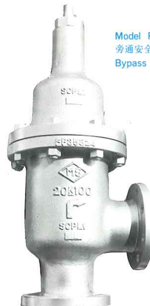
Model PV-820 旁通安全阀(1"~6") Bypass Relief valve