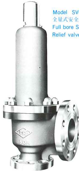
Model SVC-351 全量式安全阀(3/4"~4") Full bore Safety Relief valve